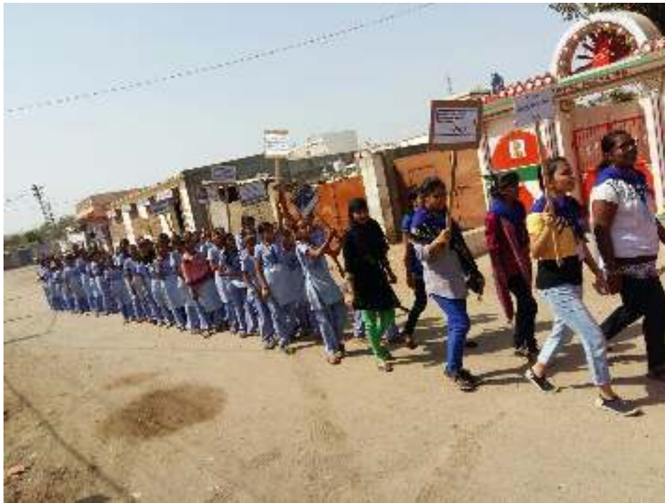
NSS DAY CELEBRATIONS