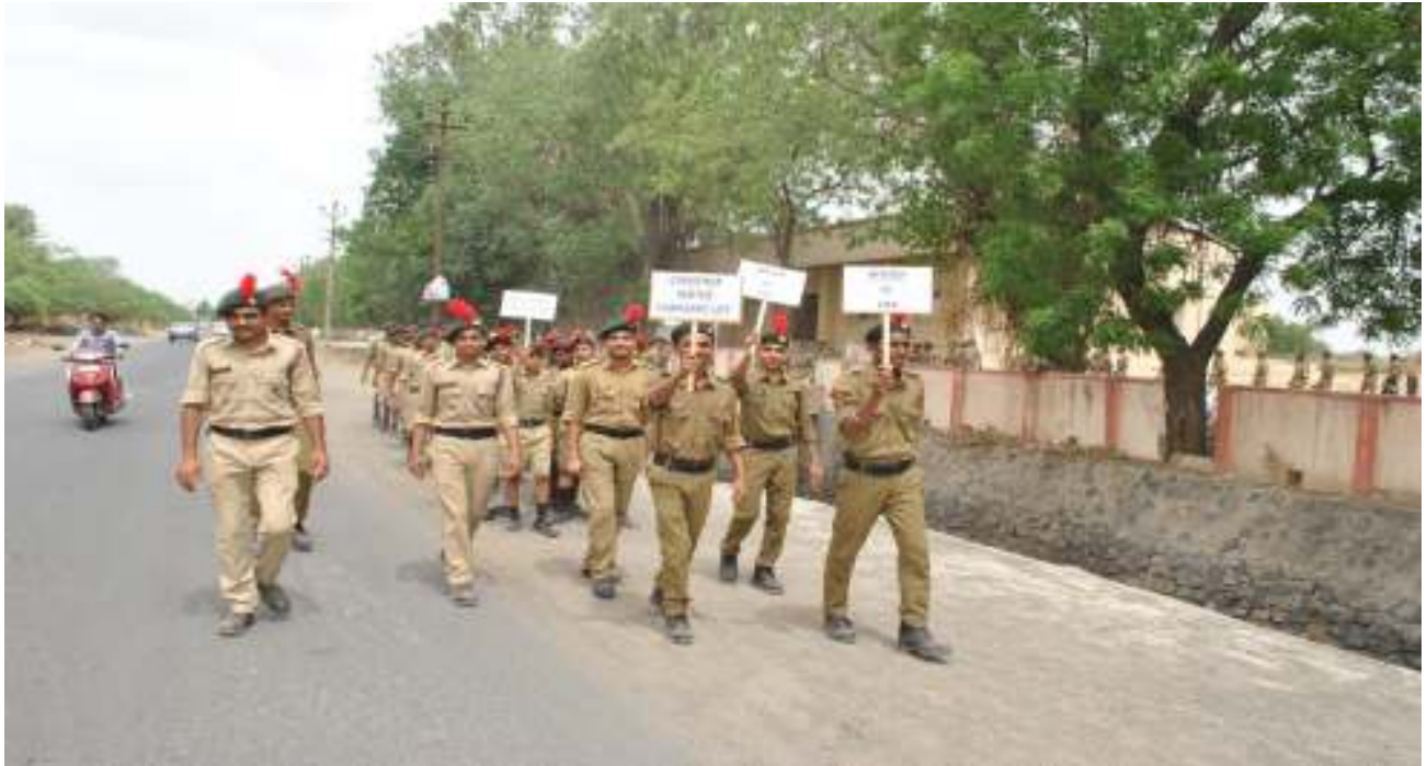
Pollution Awareness - Swachta Hi sewa (1 To 11 Jul 2019)